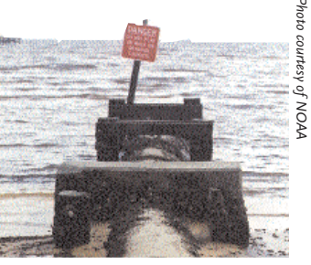
A culvert empties into the ocean.

As rainwater flows off roofs, the ground, sidewalks, and streets to storm drains, it picks up pollutants such as street litter, pet waste, automotive oil, antifreeze, and lawn and garden chemicals such as fertilizers and pesticides. Whereas household wastewater is typically sent to water treatment plants before being discharged into local waterways, rainwater, and the pollutants it picks up on its way to the storm drain, is dumped untreated, directly into the nearest stream, river, bay, or ocean.