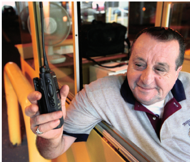
Transportation Services staff members handle parking, passenger shuttles, and mail delivery.

spect but ultimately reject, comes in the “Dissenting View” offered by a minority of the Mills committee, which was charged by President Neil L. Rudenstine in 1999-2000 to recommend policies for low-wage workers at Harvard [for the report, see www.provost.harvard.edu/adhoc/ ]. While the majority rejected a living wage in favor of benefits such as healthcare for part-time workers and subsidized language lessons for non-native speakers, the minority offered a more restricted view: that “the University has an obligation to society to support its core teaching resources and research mission in the most efficient way possible.”