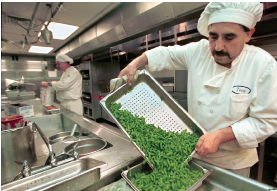
Dining Services workers prepare tens of thousands of campus meals weekly.

clear that the student sit-in struck a chord on the campus and nationwide. In some fashion or other, the University will pay more to its lowest-paid staff members and find a way to include those working for subcontractors in the higher wage—even though market forces allow for lower pay.