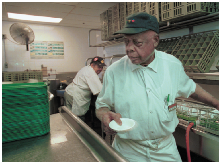
Dining-hall workers have much at stake in the committee's recommendations.

play a role, though thankfully less than they used to. Considerations of whether higher pay induces workers to provide more effort, especially in relation to norms of fairness, play a role. Government regulation plays a role. And plain old luck plays a role.