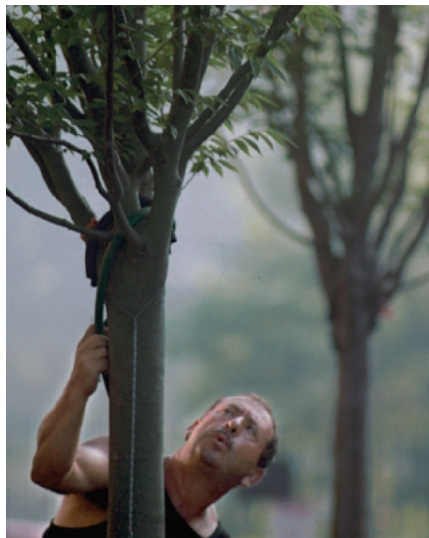
An extensive crew tends Harvard’s grounds.

If Harvard were a business near bankruptcy, one would worry about paying higher wages. If living wages required massive pay increases or covered the bulk of employees, one might dismiss the demands as irrational posturing. But with its huge endowment and successful fund-raising campaign, Harvard has what economists call “economic rent” or surplus that it can spend on raising pay at the bottom of the wage scale if it so desires. Paying the living-wage campaign demands will simply move Harvard’s lowest-paid employees higher in the Boston-area wage scale, not off the scale.